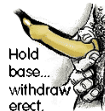
Hold base... withdraw erect.