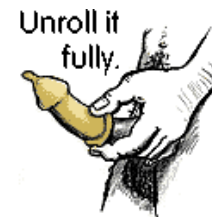
Unroll it fully.