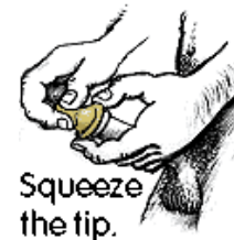
Squeeze the tip.